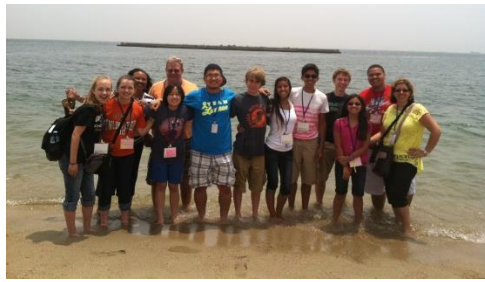
The 2014 High School Delegation Enjoying a beautiful day at the beach in Japan