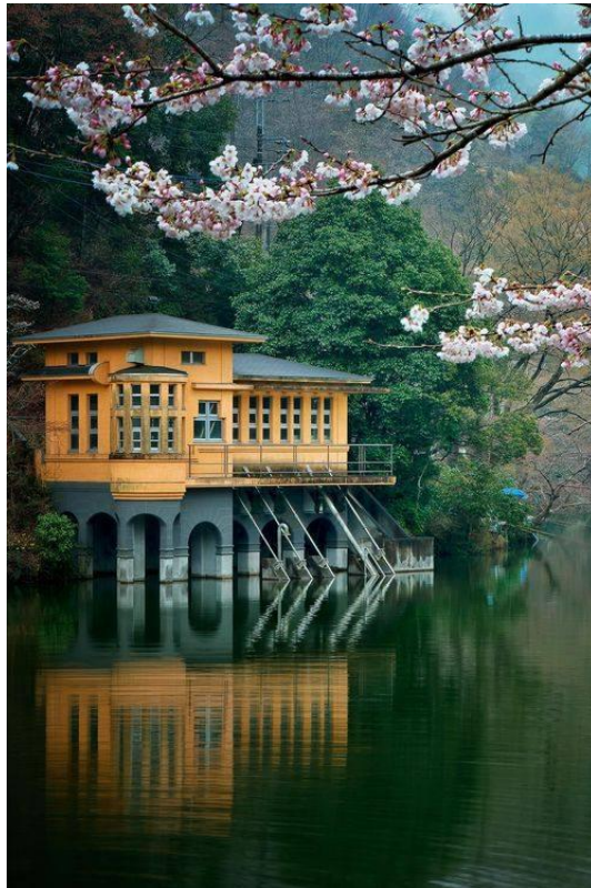
Not Lima, but Lake House in Saitama, Japan

The Japanese Garden in downtown Lima is located along the Ottawa River walkway near the Lima YMCA. The cherry trees planted there are gifts from Harima-cho school children, and Lima donated redbud trees. All should be blooming soon. Be sure to visit and enjoy!